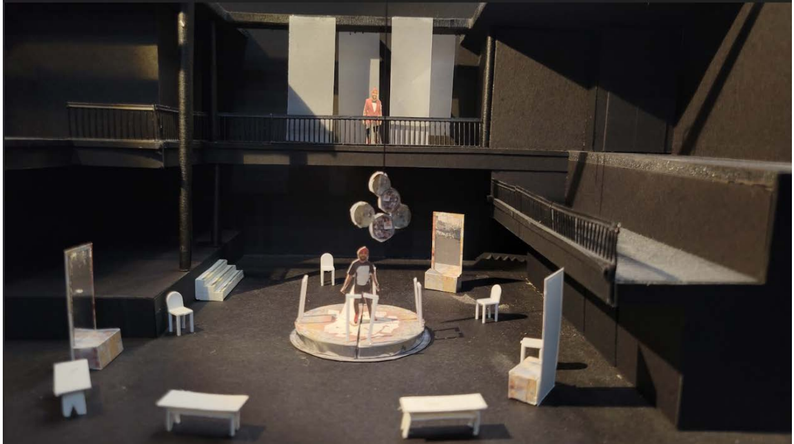
The picture features a model of the set that will be used for As I Must Live It as described above in the above paragraph. Model & Set Design by Jackie Chau.