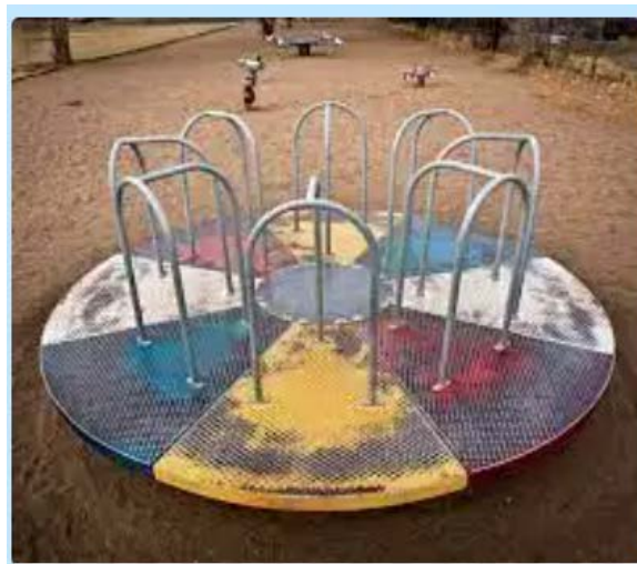
This picture features a real-life example of a kid's playground spinning equipment. It is a circular platform that has handles and spins.