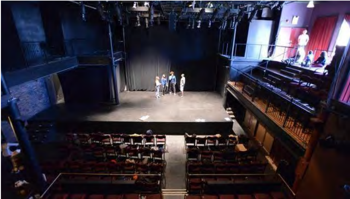
This picture shows the Main Space stage and audience seating areas, taken from the 2 nd floor.

The Mainspace doors will be opened half an hour before your show is set to start. Sometimes the stage or seating looks a little bit different depending on the show. If you need to leave the space at any time you can exit through the door to the lobby.