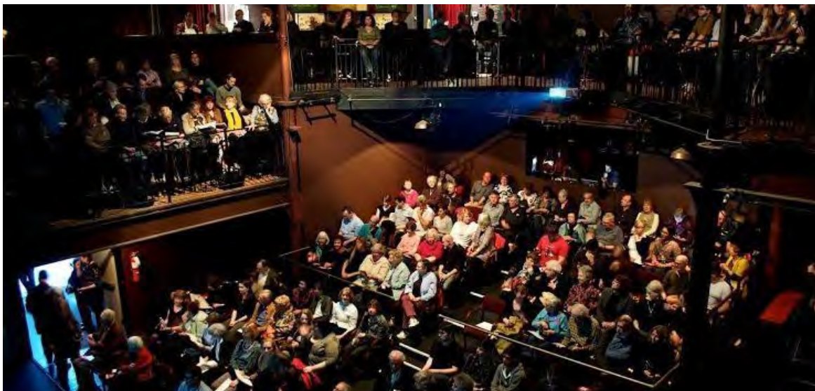
This picture shows the audience seating of the Main Space with a full audience, taken from the 2 nd floor.

Theatre Passe Muraille is located at: 16 Ryerson Avenue, Toronto ON Questions? Email jenns@passemuraille.on.ca or call 416-504-8988 x 2172