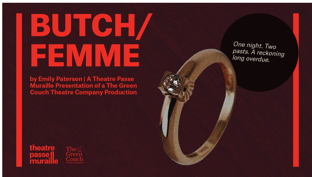
Image description: The graphic is promoting the play BUTCH/FEMME by Emily Paterson being presented at Theatre Passe Muraille. The central image is a gold wedding ring with a diamond.

Theatre Passe Muraille's crimson red branding lines are on each side of the image, the TPM and The Green Couch's logo are on the bottom left of the image.